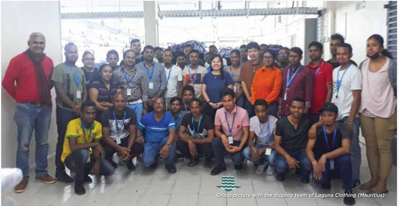
Group picture with the dipping team of Laguna Clothing (Mauritius)