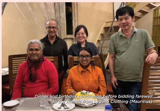
Dinner and birthday celebration before bidding farewell to our friends from Laguna Clothing (Mauritius)