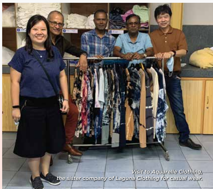
Visit to Aquarelle Clothing, the sister company of Laguna Clothing for casual wear.

Approximately 70% of the population is of Indo-Pakistani origin, most of whom are descendants of labourers brought to work in the sugar industry during the earlier days. Although English is the official language, it is spoken by a very small percentage of the population. Creole, a French-based dialect, is spoken by majority of the population and is the lingua franca of the country.